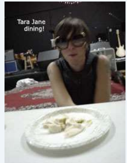
TJO eats dinner