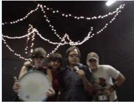
Amy Ray and the Volunteers at practice 8/2/05-Atlanta