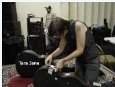
TJO packing up her bass